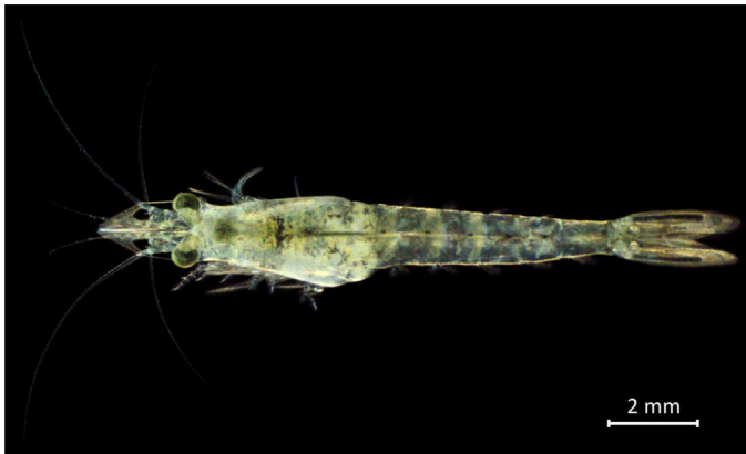
Fig. 1. Adult female specimen of P. lacustris .